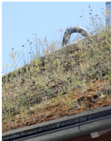
On this side the roof is greened, on the other side a PV system and solar thermal collectors are installed.

The CO 2 released by the gas lamps in the rooms is reliably removed by the ventilation system. I'm very happy with this archaic method of heating, but it won't appeal to everyone. The ingenious thing about Passive House buildings is that they offer diverse possibilities for heating systems, depending on the user's taste and purse.