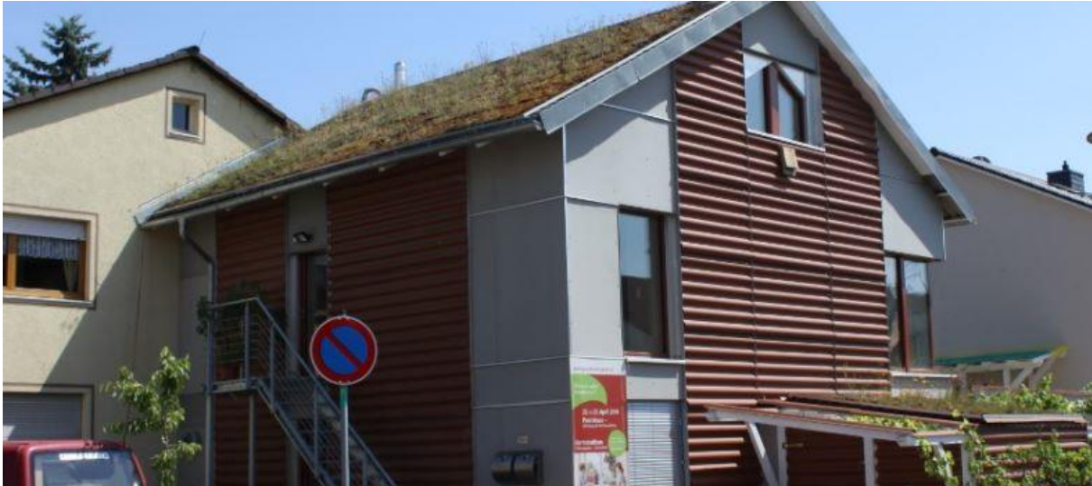
The house belonging to the parents is at the back, the Passive House with straw bale insulation in the front. The production of straw requires very little energy and straw is very suitable as an insulation material.

Towards the south, the roof is almost completely covered with solar thermal collectors and a photovoltaic system. The solar energy thus provides us with hot water and generates electricity. The greened northern roof looks beautiful and ensures slower rainwater drainoff for a better micro-climate and relieves the sewage system.