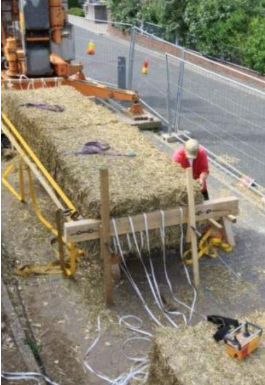
The baling press with which straw bale insulation was produced for Benjamin Krick's house.

insulating value for an insulation material. In order to achieve the same level of thermal protection as conventional insulation materials, the insulation must be thicker by around a third. This may be a disadvantage if the prices for building land are high. Since straw is a natural product, it starts rotting if it gets wet. Therefore, special attention must be given to flawless installation in terms of building physics, so that the straw stays completely dry.