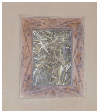
The straw insulation provides for a unique wall decoration inside.

In the first winters, if the heat from the solar heating system was insufficient, I used an electrical heating rod in the solar storage tank for supplementary heating. Unfortunately, that broke even though it was supposed to last at least 15 years. What a nuisance! Conclusion: you should have as little technology as possible, i.e. a passive construction like mine. Then it is easier to bear with a faulty heating system.