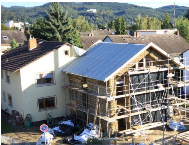
Completed! The insulation has been installed. The bales are stacked on top of each other, after each layer of straw a structure resembling a ladder is inserted.

It took longer than planned. That is why, if I had to build once again, I would prefer to use smaller bales which can be moved by hand. This makes more sense, at least for such a small building site.