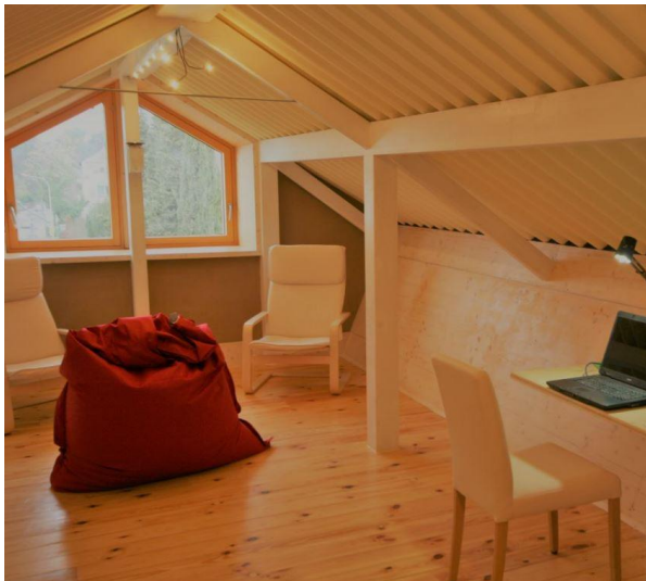
The gallery on the upper floor of Benjamin Krick's house in Seeheim-Jugenheim.

During the construction phase we protected the bales with tarpaulins. This is a tiresome but necessary task which must also be performed with regular timber constructions. The problem with weather can be mitigated considerably through prefabrication by a carpenter, for example. A good idea! The straw bales are now protected by the ventilated façade and the roof consisting of fibre-cement. Some people apply plaster or even loam to the straw bales on the outside as well, and have had success with this, but I was afraid to try that.